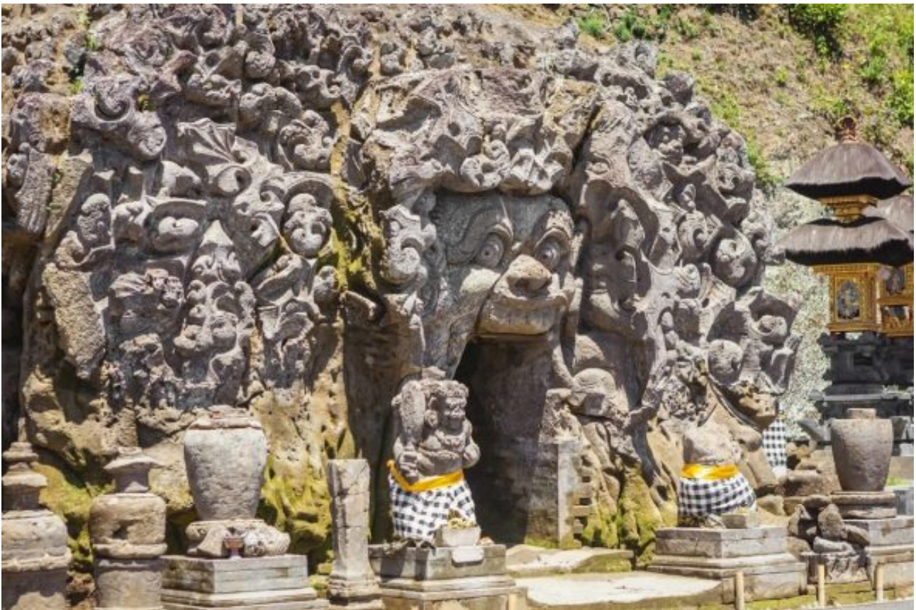
Goa Gajah – Best Tourist Attractions in Bali

The Elephant Cave as it's known – Goa Gajah in Balinese – is an ancient temple on the outskirts of Ubud. While the steps down to the temple complex are fairly steep, it's only a 5-minute walk and not difficult for average fitness levels.