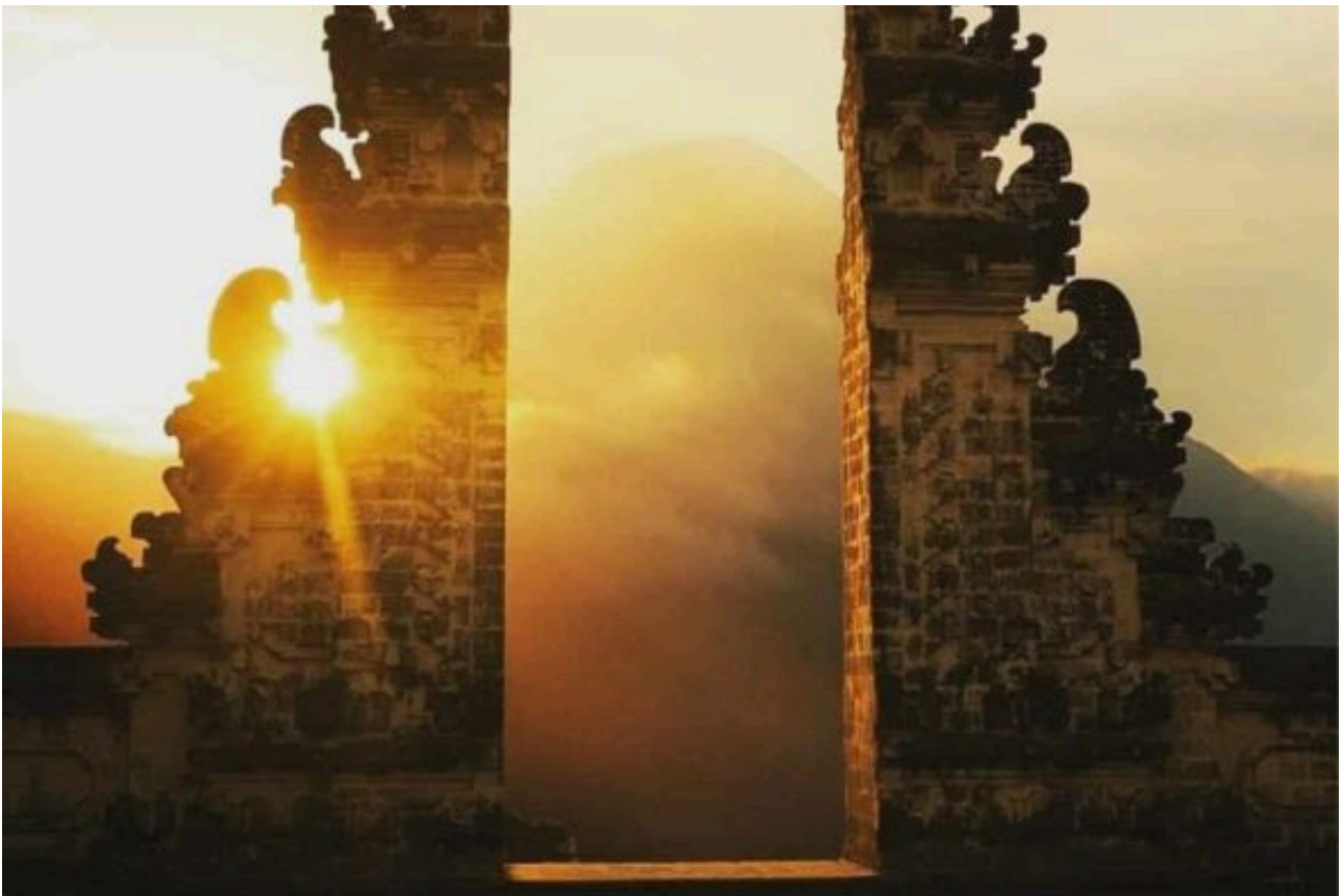
Lempuyang Temple Sunrise Tour

That being said, if you are in Bali for longer than two weeks I highly recommend the trip to Lempuyang as the temple complex is inspiring for the walk up to the main stone staircase looking up towards the gates.