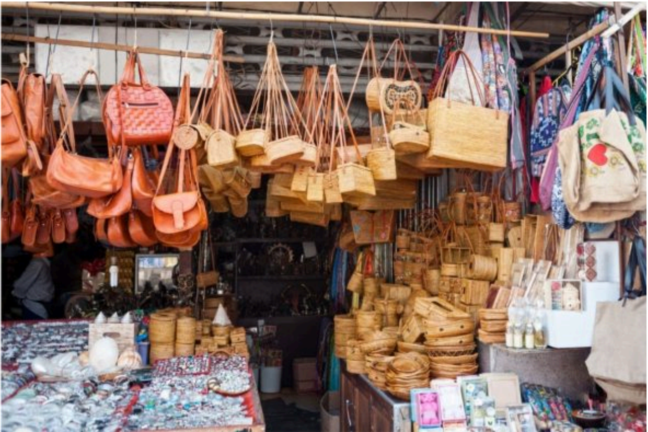
Ubud Art Market