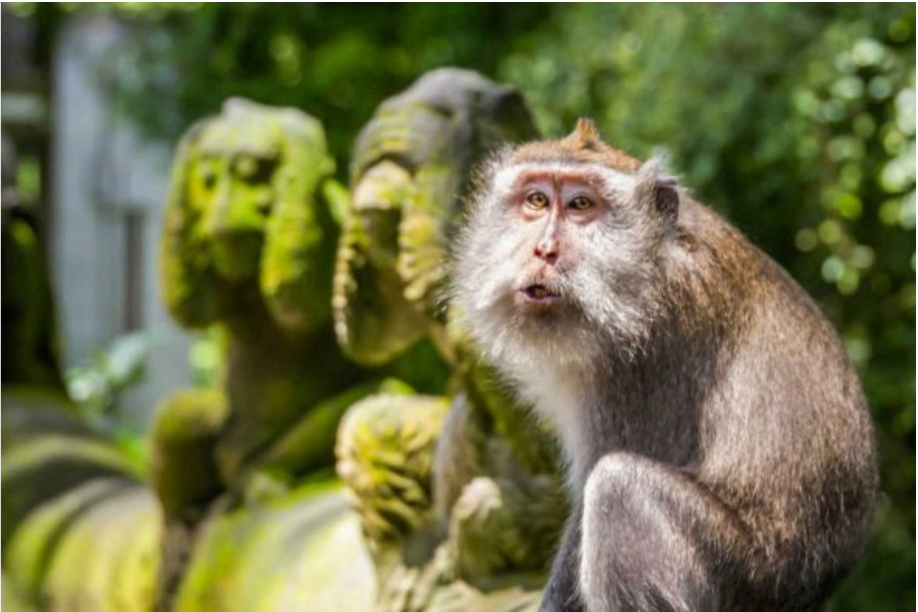
Ubud Monkey Forest – Best Tourist Attractions in Bali