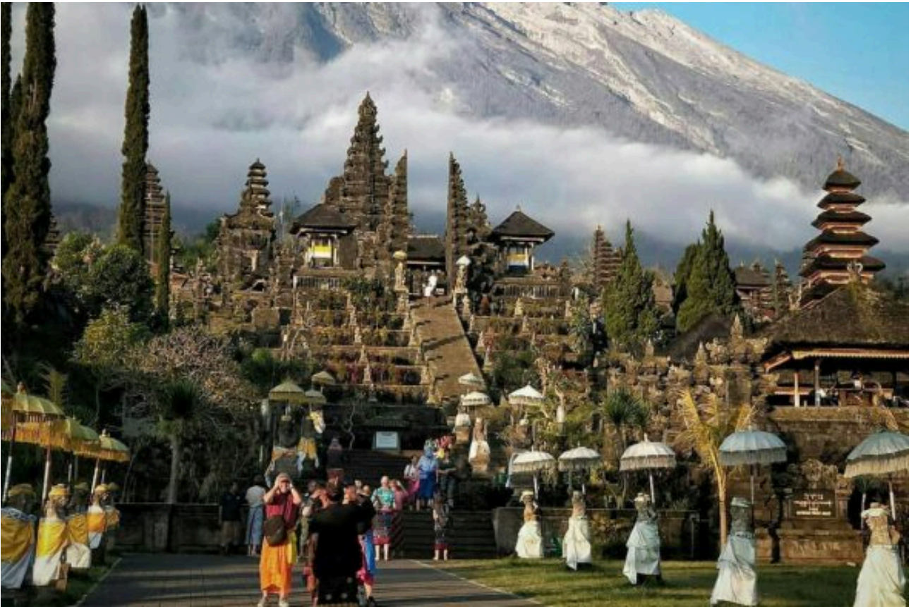
Besakih Temple – Best Tourist Attractions in Bali

Besakih Temple is more impressive, in my opinion than Lempuyang Temple, which is a huge deal on Instagram, thanks to the fake reflective-pool photos taken using a mirror on the camera lens, creating a false illusion of what the temple actually looks like.