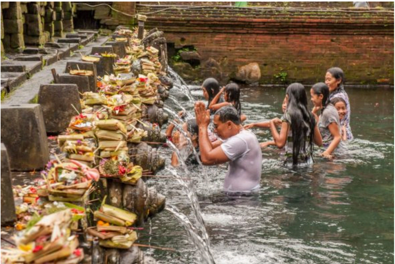
Pura Tirta Empul – Best Tourist Attractions in Bali

One, there was an outbreak of e.coli in 2017 due to contaminated water leaking into the water table upstream from the springs in. The water has been cleaned up since then, but if another outbreak happens I'll send word through the email newsletter, which you will want to sign up for.