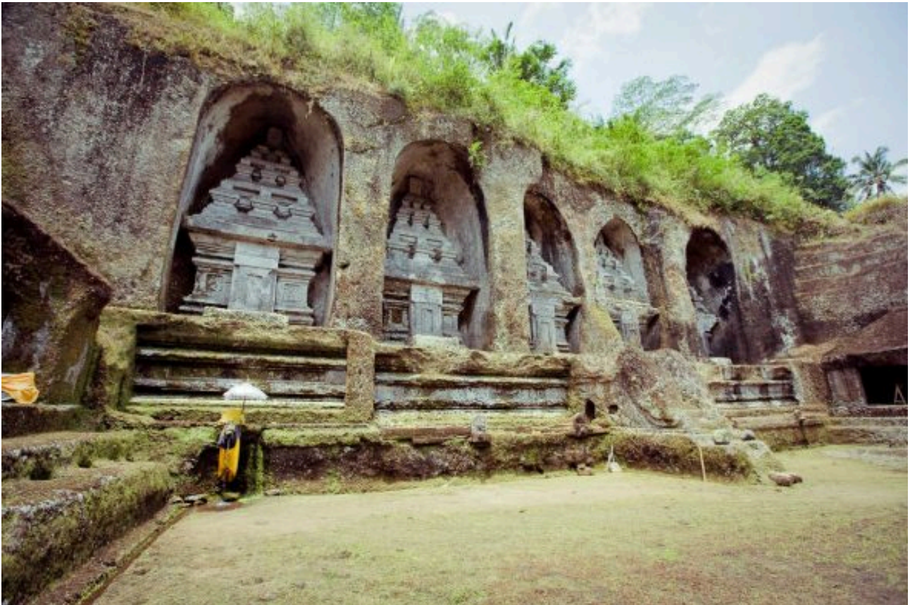
Gunung Kawi – Best Tourist Attractions in Bali

Gunung Kawi Temple is an 11th-century temple complex that sits on either side of the Pakerisan river. It comprises 10 rock-cut shrines (candi in Balinese) that are carved into 7-metre-high sheltered niches of the sheer cliff face.