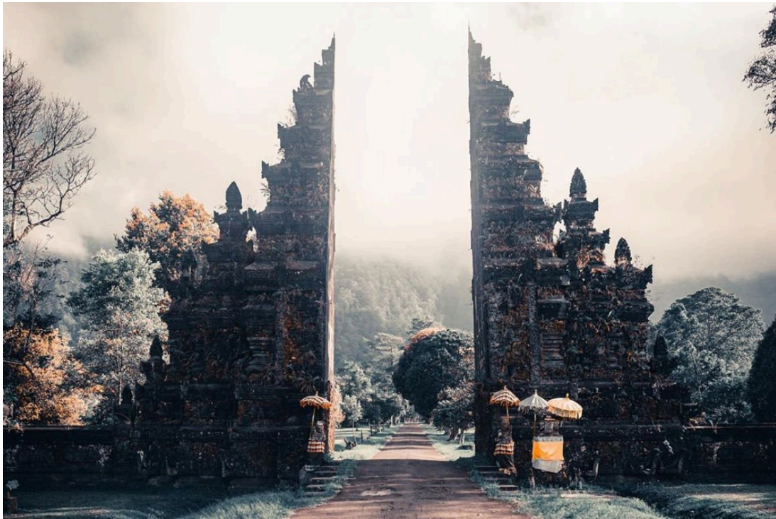
Handarah Gates – Best Tourist Attractions in Bali