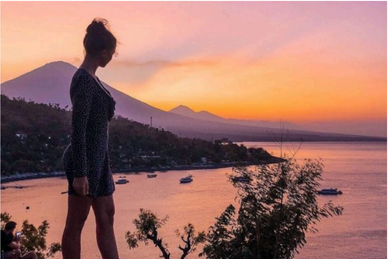
Amed Sunset – Best Tourist Attractions in Bali

It's a long drive to get there, and the road from the east side of Bali is often quite busy with heavy trucks transporting goods and construction materials to the main centres, so extra care needs to be taken as overtaking on the wrong side of the road appears to be quite an acceptable driving manoeuvre.