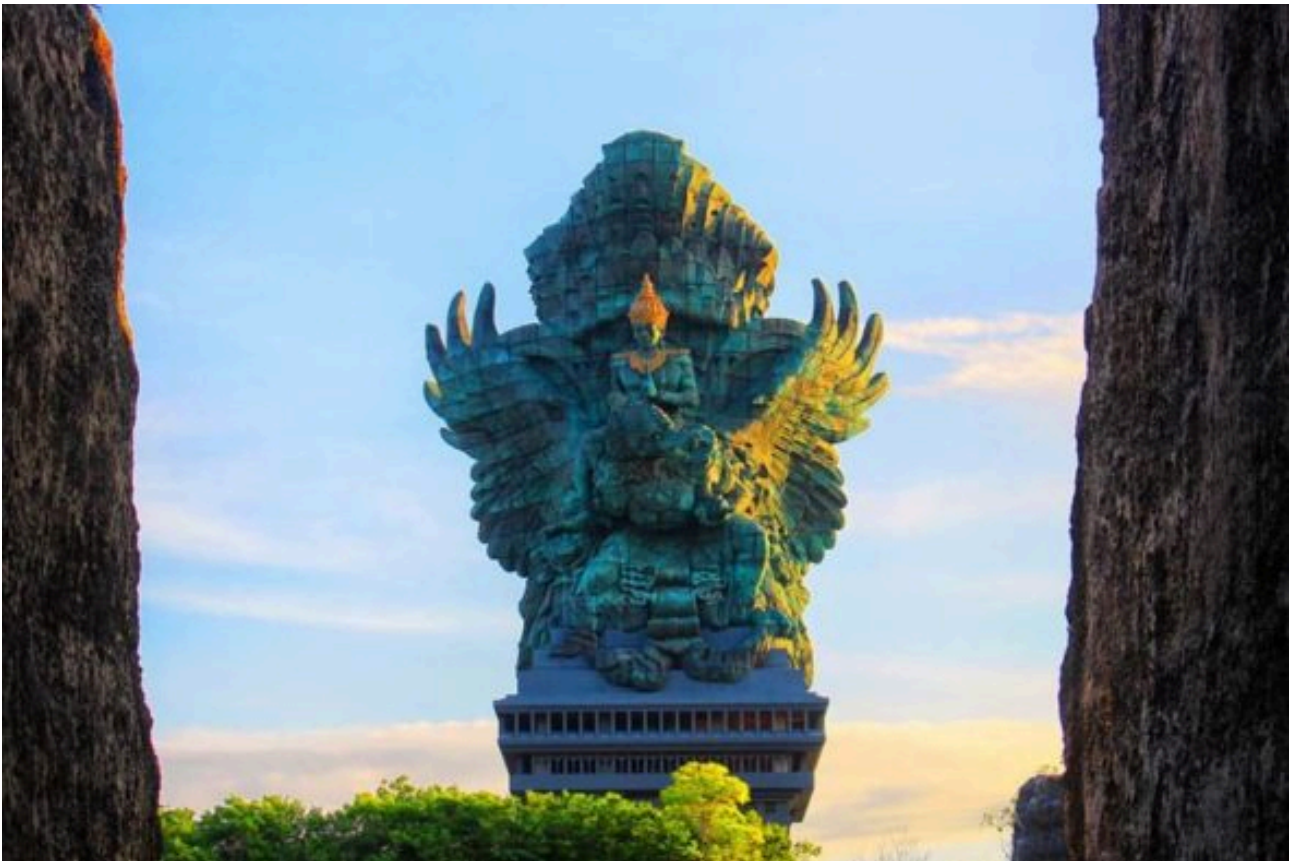
Garuda Wisna Kencana Cultural Park – Best Tourist Attractions in Bali

Indonesian President Joko Widodo on 22 September 2018 and is already attracting over 3,000 visitors a day.