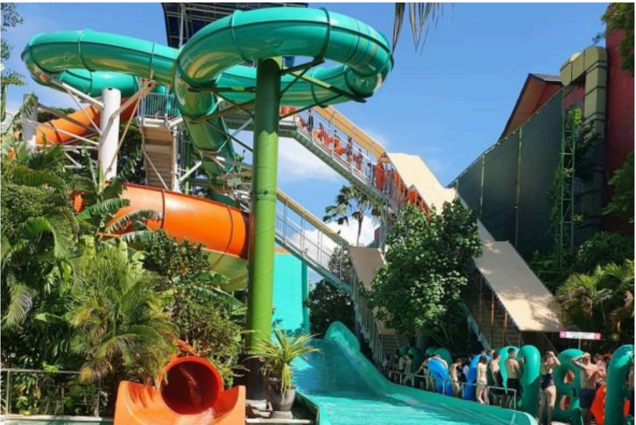
Waterbom Bali – Best Tourist Attractions in Bali