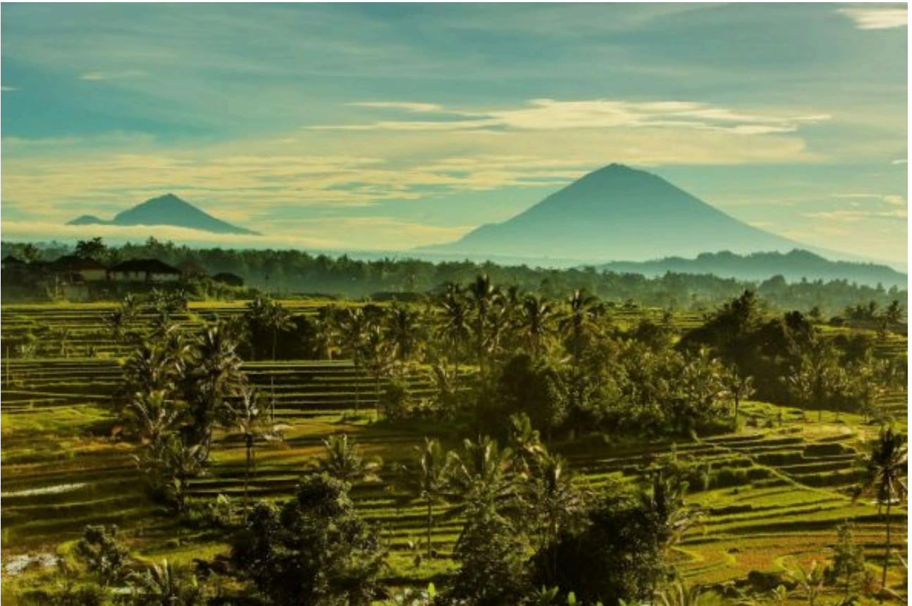
Jatiluwih Rice Terraces – Best Attractions in Bali