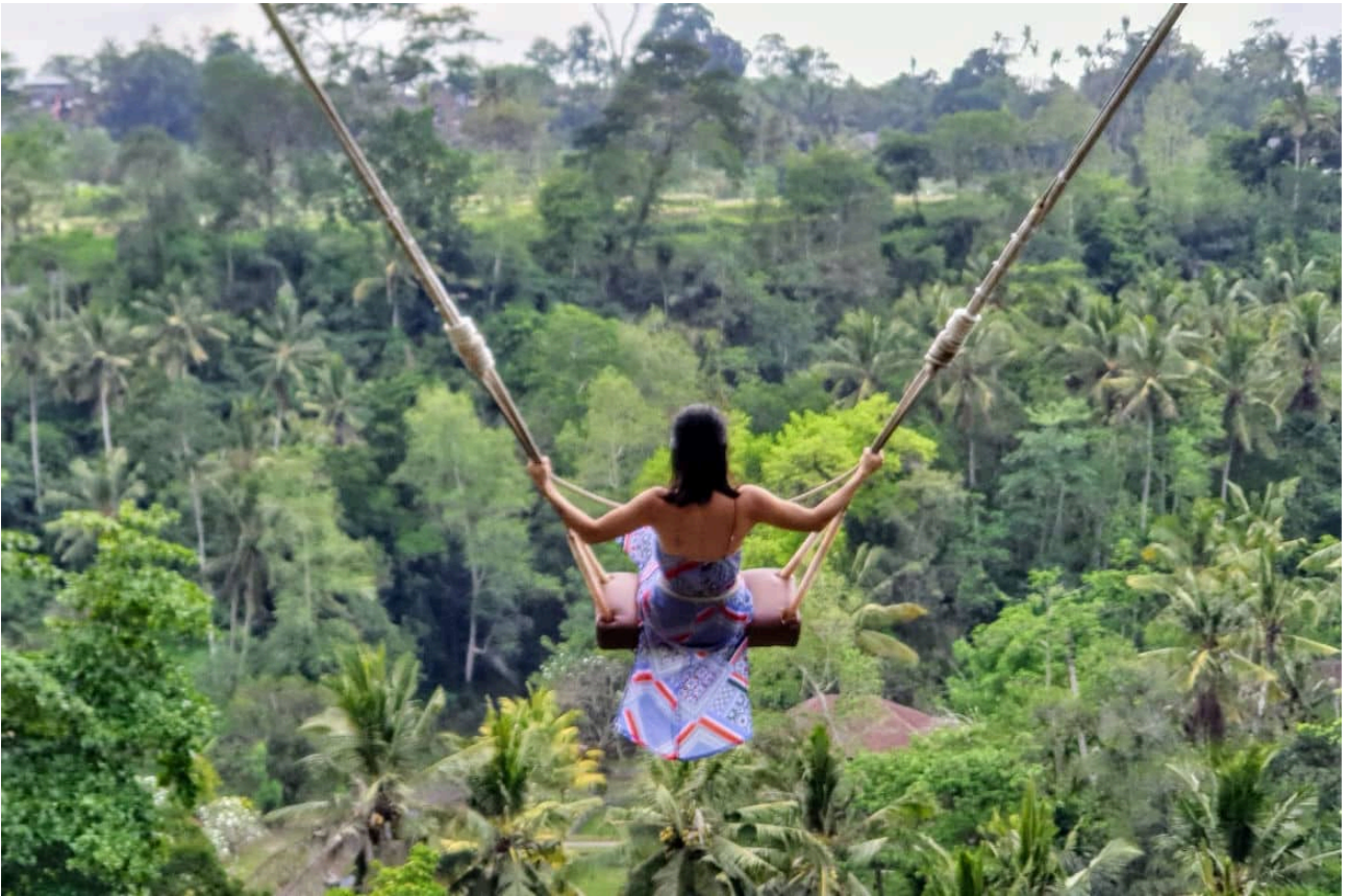
Real Bali Swing – White Water Rafting Ubud Tour

The Real Bali Swing is included in my White Water Rafting Ubud Tour .