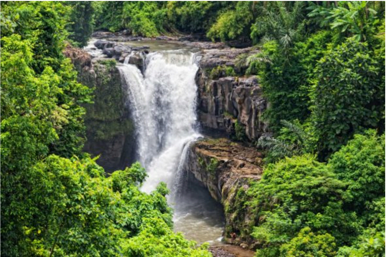
Tegenungan Waterfall – Best Waterfalls in Bali

Be warned, when the river is flowing hard after rainfall the current is exceptionally strong, so make sure you only cross the river to climb the falls from the opposite bank if you really know what you're doing.