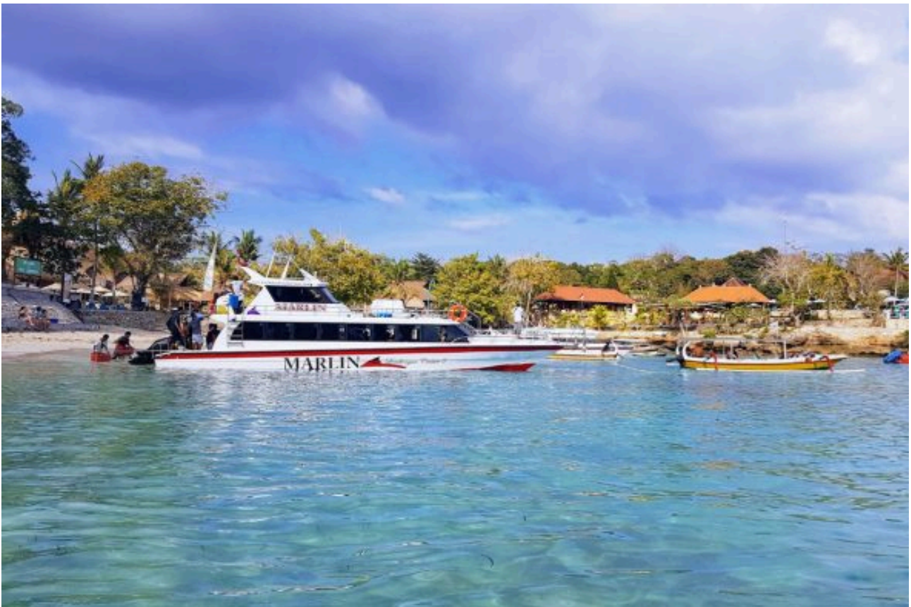
Nusa Lembongan – Best Tourist Attractions in Bali

Entrance Fee: Free, but you must buy for a ferry ticket to get there