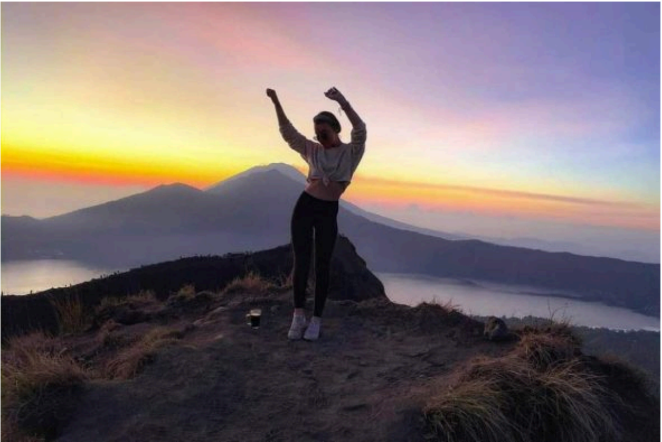
Mount Batur – Kintamani

One of the most extraordinary adventure activities in Bali is to go on a Mount Batur Sunrise Trek .