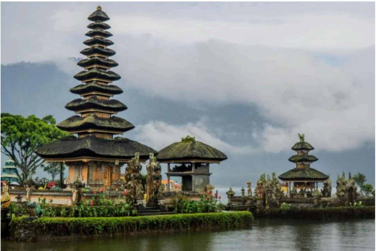
Ulun Danu Beratan

I have a tour specifically for Danu Beratan , but because it's on the way to several of Bali's most spectacular waterfalls, it's also included in several other tours, including the Gitgit and Aling-Aling Waterfall tours.