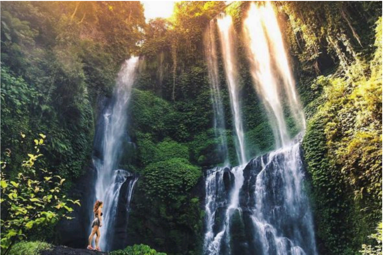
Sekumpul Waterfall – Best Waterfalls in Bali

Make sure you have decent walking shoes because the track is quite steep in places and the rocks can be very slippery. Take your time, you do not want to sprain an ankle this far away from medical services.