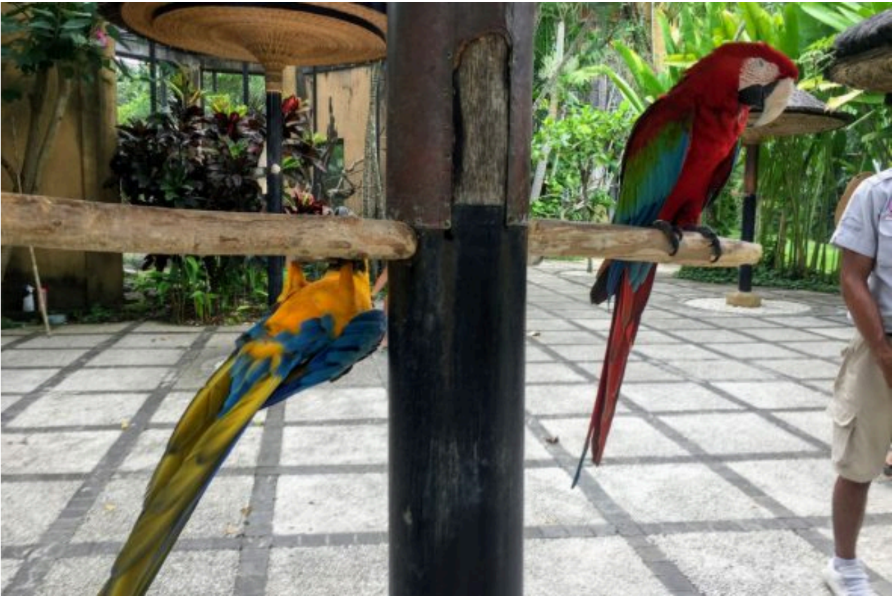
Bali Bird Park – Best Tourist Attractions in Bali