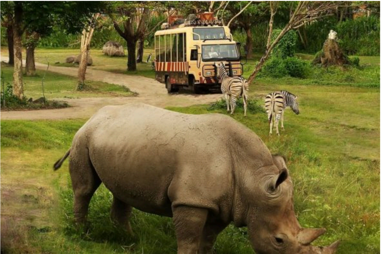
Bali Safari & Marine Park – Best Tourist Attractions in Bali